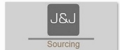
15 J and J Sourcing