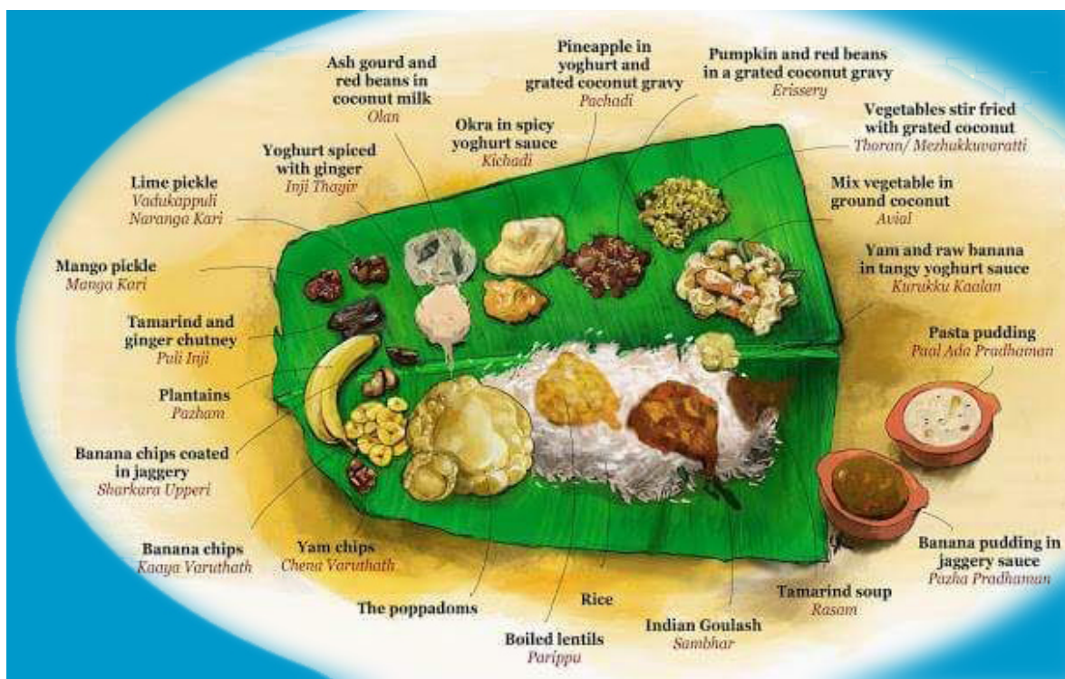
An Onassadya with descriptions of the dishes (lest we forget!)

Here is an image of the food items served in a traditional Onassadya . The image also contains descriptions of the dishes.