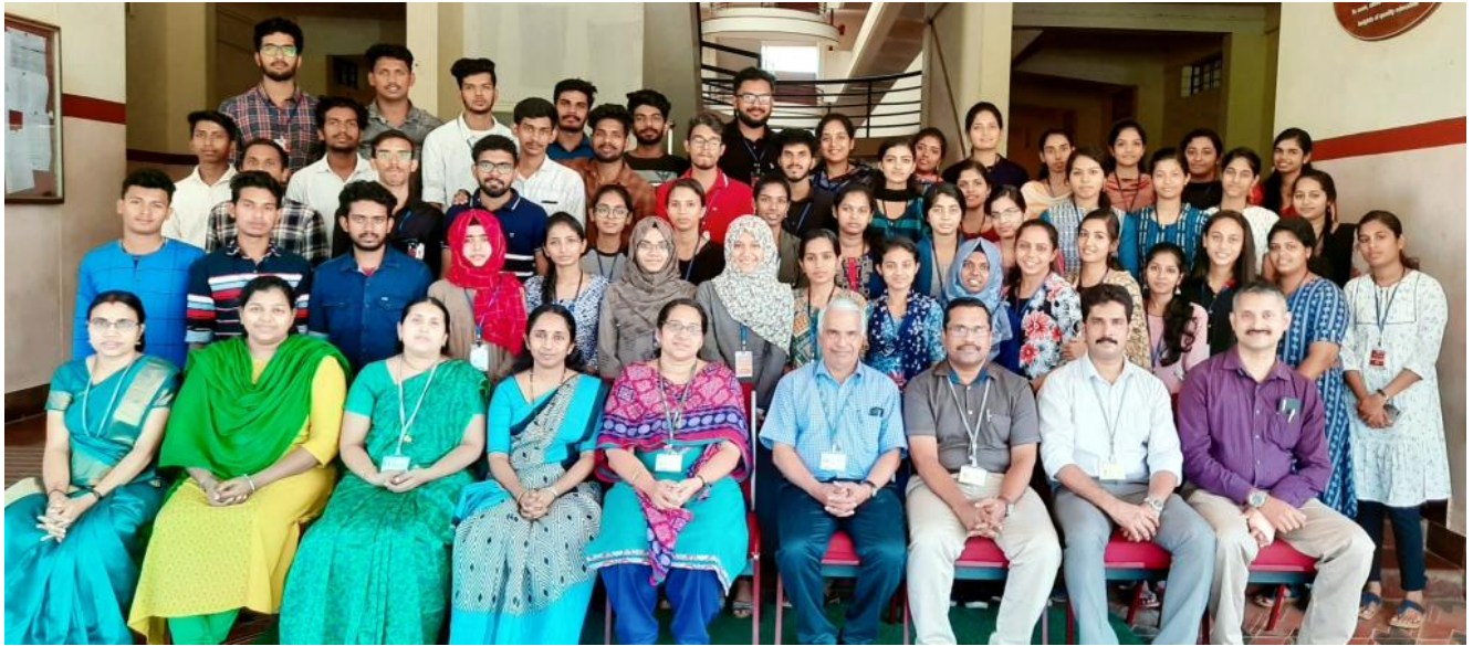
Participants with MCA Dept faculty and staff